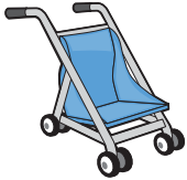
Strollers & wagons with an infant or toddler present