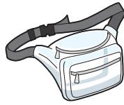
Clear fanny pack